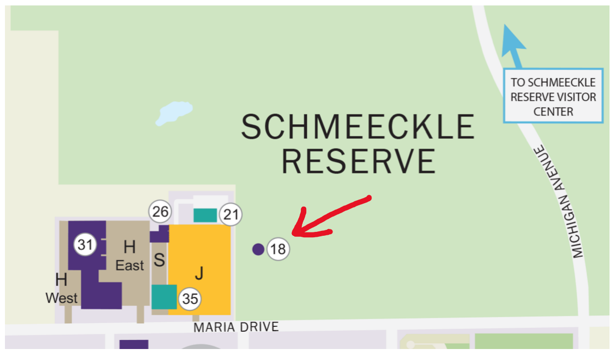
Figure 2. Map of Schmeeckle showing the meeting location at Schmeeckle pavilion, labeled number 18.